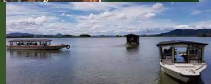
※The set plan is the price for one person when 5 people use it. ※Charter Taxis are for 9 people. ※The price may be revised.