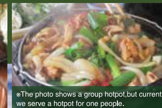
※The photo shows a group hotpot, but currently we serve a hotpot for one person.